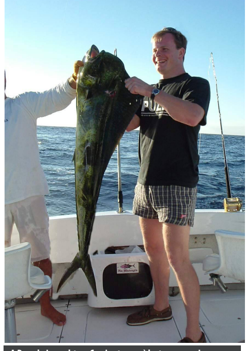
A Darado I caught on Carsington res` last summer, I was glad when the bigger one got away. There just wasn't room in the boat for both of us!